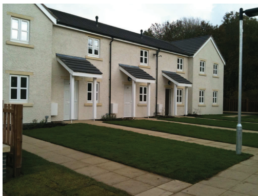
Affordable housing development at Windermere Road, Carnforth.