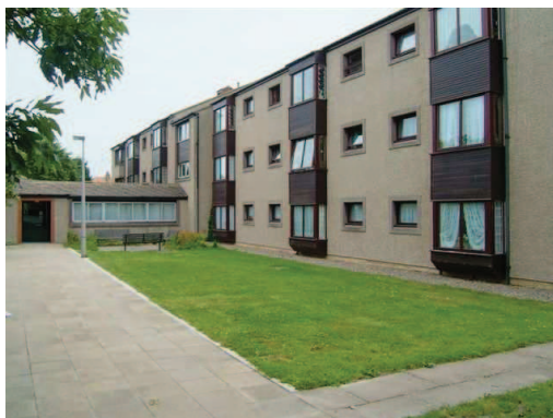
Council owned housing at Kingsway Court, Heysham