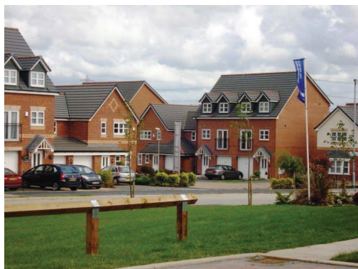
Market housing development at Mossgate Park, Heysham