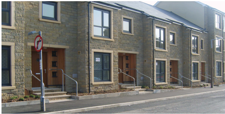
Affordable housing development at Marlborough Road, Morecambe