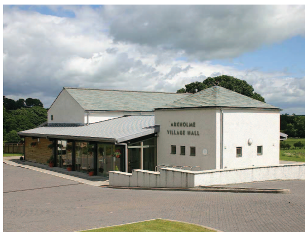
Arkholme Village Hall.