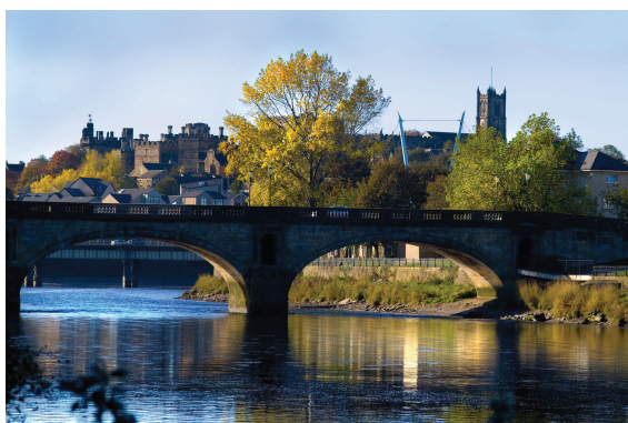
Lancaster Castle from across the River Lune