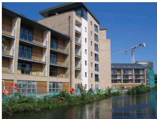
Market housing development at Aalborg Place, Lancaster