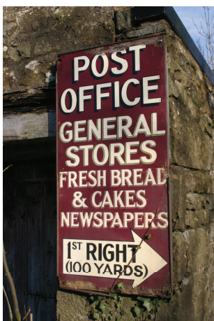
Post Office and General Stores sign in Wray village.