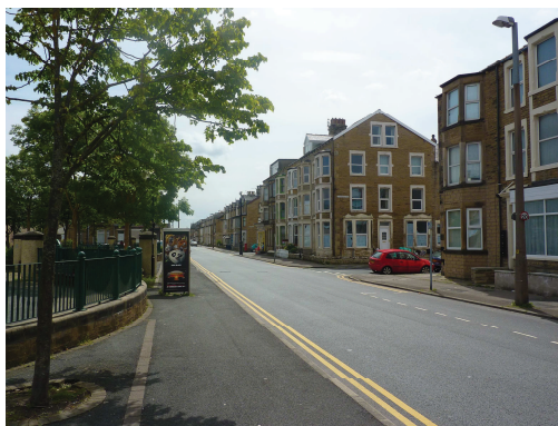
Victorian housing in the West End of Morecambe