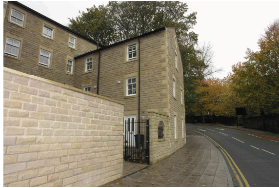
Affordable housing in the centre of Lancaster