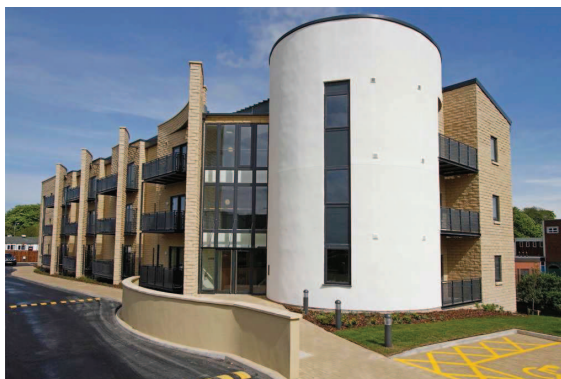
Affordable housing development at City View, Greyhound Bridge Road, Lancaster