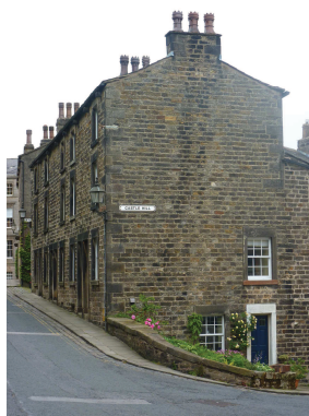
Terraced housing at Castle Hill, Lancaster.