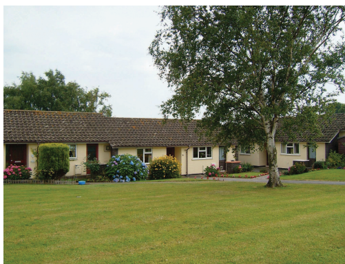
Lancaster City Council owned accommodation for older people at Vale Estate, Lancaster